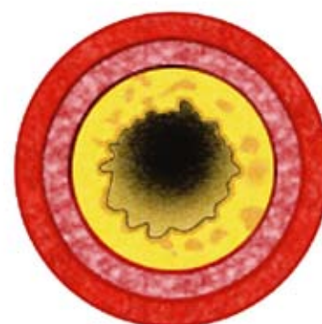
Inside the blood vessel of a smoker showing blockages.